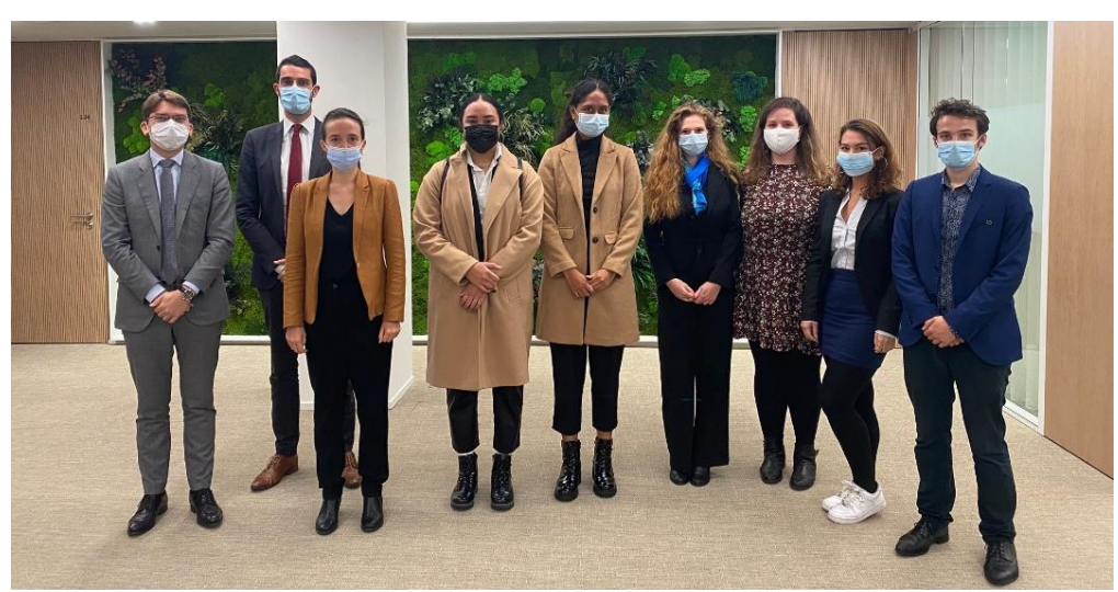
Permanent Representation of the Netherlands: